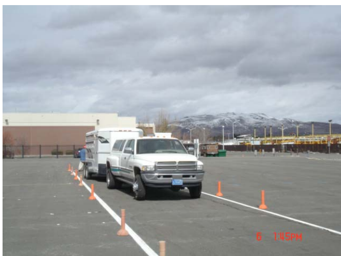
Bonnie Replogle—straight line backing