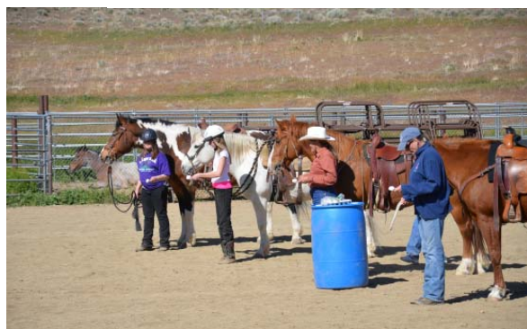
In-hand Egg and Spoon