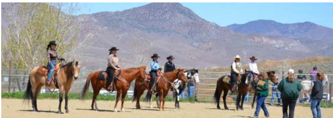
Western Pleasure Class—18 & Over